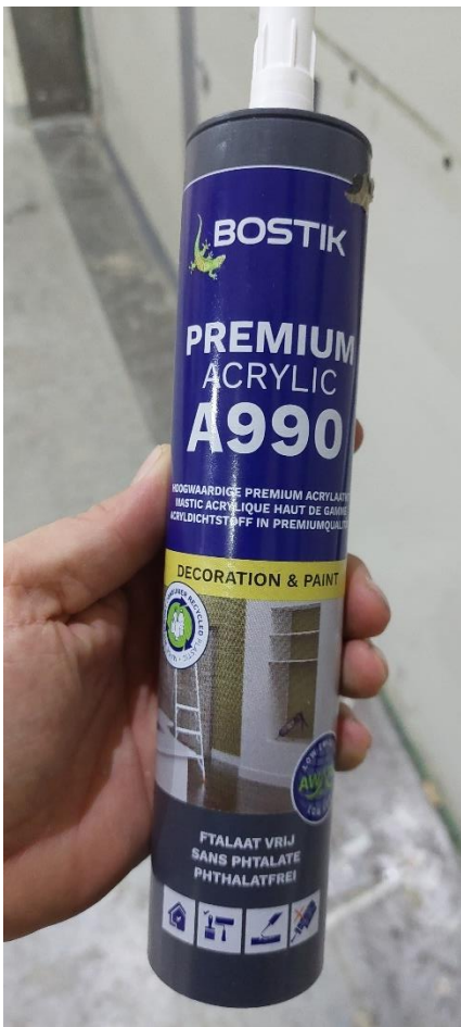
Picture 2. Cartridge of the sample