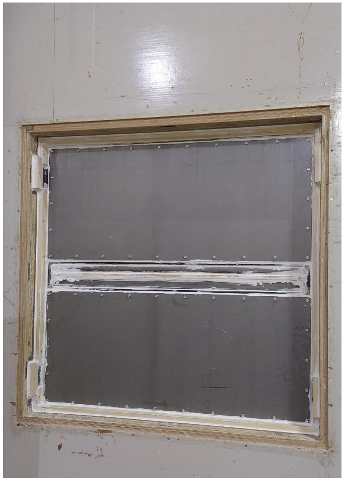
Picture 3. Test element installed to the test wall opening