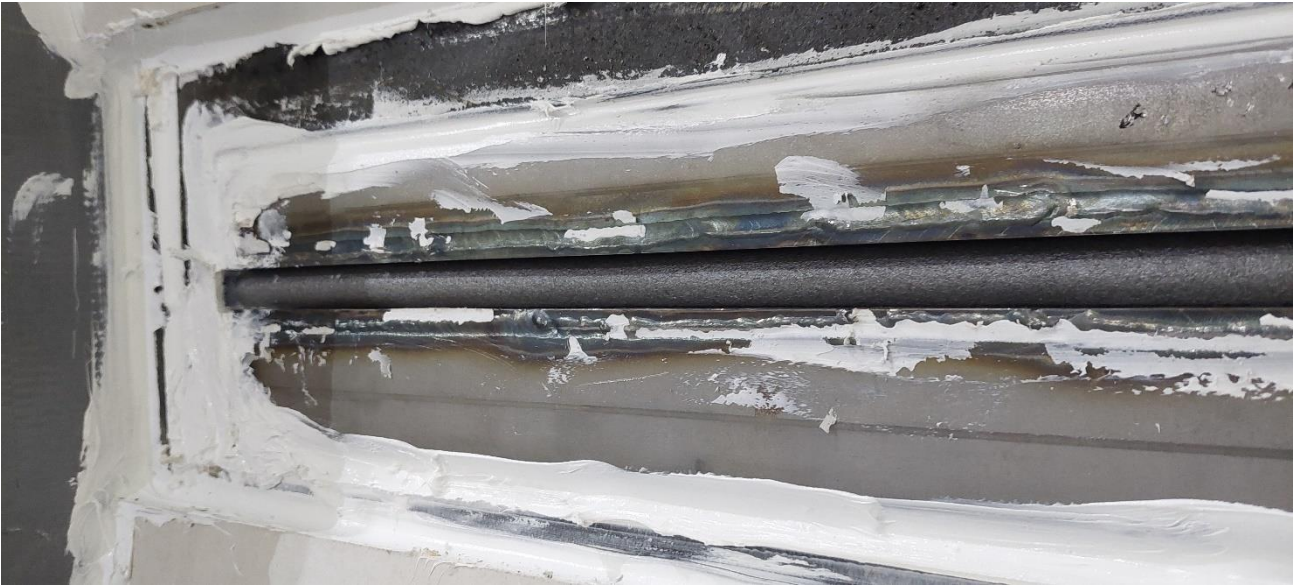
Picture 1. Backer rod installed to the test gap