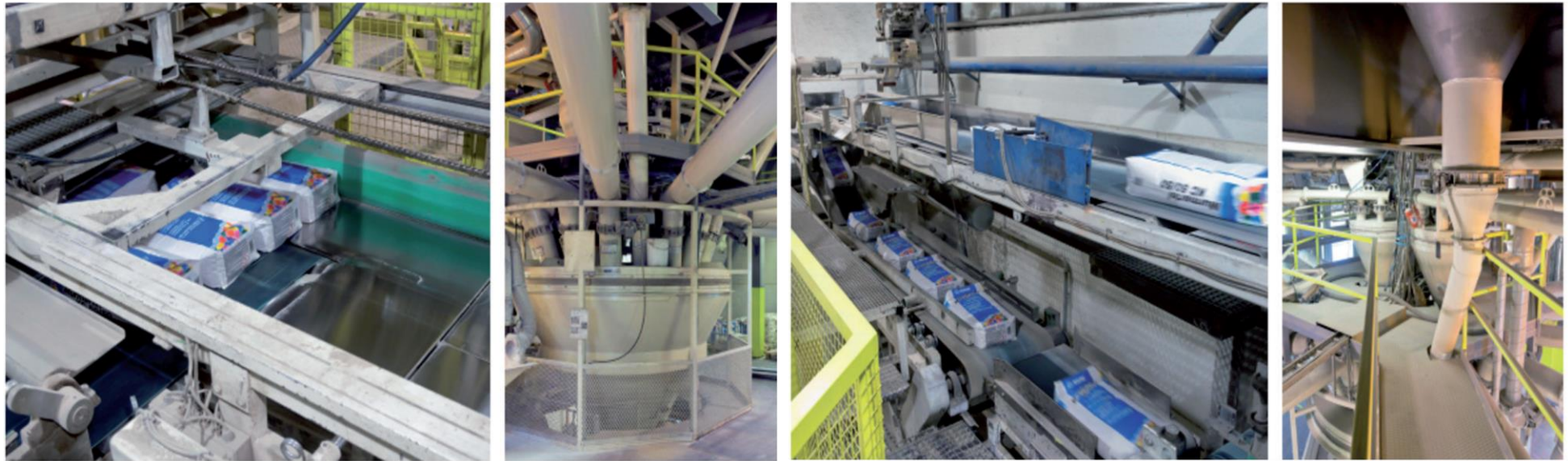
Figure 1: production process detail

The production process starts from raw materials, that are purchased from external and intercompany suppliers and stored in the plant. Bulk raw materials are stored in specific silos and added automatically in the production mixer, according to the formula of the product. Other raw materials, supplied in bags, big bags or tanks, are stored in the warehouse and added automatically or manually in the mixer. The production is a discontinuous process, in which all the components are mechanically mixed in batches. The semi-finished product is then packaged, put on wooden pallets and stored in the finished products warehouse. The quality of final products is controlled before the sale.