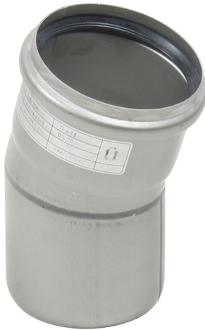
BEND 15°, Ø75MM - Syrefast stål: AISI316L/EN1.4404