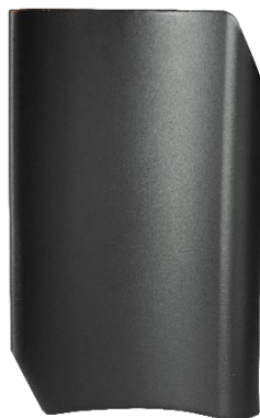
RT 840 (Engobed tile)