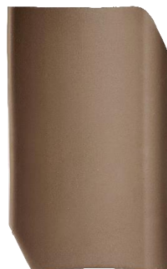
RT 807 (Brown tile)