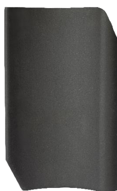
RT 810 (Damped tile)