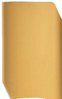
RT 811 (Yellow tile)