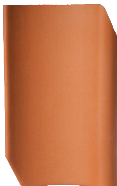
RT 806 (red tile)

The illustrated products below are examples of products covered by this EPD.