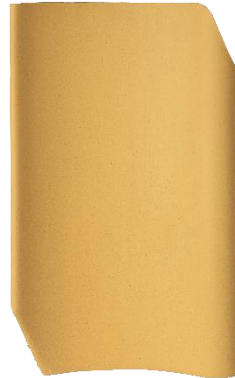
RT 811 (Yellow tile)