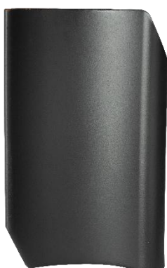
RT 840 (Engobed tile)