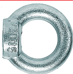
Ring nut RI