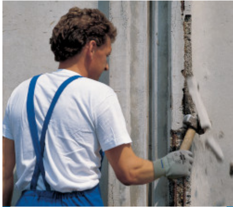
Demolition of degraded concrete

The application of the repair mortar (e.g. products of the Mapegrout line) that follows, can be carried out on cured Mapefer after approximately 6 hours at +20°C.