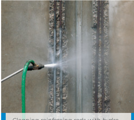
Cleaning reinforcing rods with hydro-sandblasting