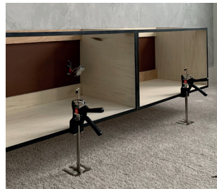
Fitting kitchens and furniture