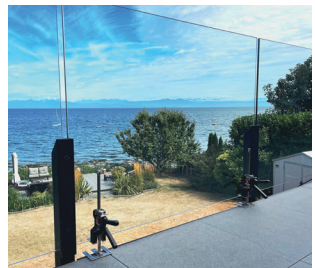
Install gates and fences