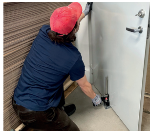
Install windows and doors