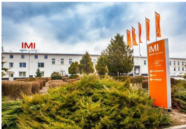
Figure 1 The view of IMI International Sp. z o.o. manufacturing plant located in Olkusz

As IMI Hydronic Engineering is a leading HVAC company with a valves montage plant located in Olkusz (Poland). Company is provider of technologies that deliver energy efficient water-based heating and cooling systems for the residential and commercial building sectors. Throughout the history, company have been at the forefront of HVAC industry innovation. The portfolio of brands has what is needed – a complete range of unique, industry-leading products and services. IMI Hydronic Engineering is a part of IMI PLC Group, listed on the London Stock Exchange on FTSE 100 list.