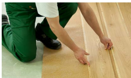
Fig. 3. The view of 3-layer wooden floorboard produced by Barlinek Inwestycje Sp. z o.o. during installation

The Barlinek floorboard can be installed in a floating system, that is glueless and based on modern tongue-and-groove joints. It is a method, that allows to install the floor yourself. The floor is also easy to be dismantled or re-installed. An alternative is to install the floor in a traditional way - by gluing the boards to the subfloor, which ensures stability of the installation even on large surfaces. The Barlinek floorboard does not require any additional preservative treatment. The floor is ready for use immediately after installation. The performance of the product is listed in Table 2.