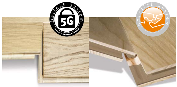
Fig. 2. Views of Barlinek floorboards with 5Gc BARLOCK and BARCLIK systems