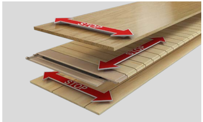
Fig. 1. Cross structure of 3-layer wooden floorboard produced by Barlinek Inwestycje Sp. z o.o.

Barlinek floorboard is made from three layers of real wood arranged in a cross structure (Fig. 1) in order to prevent swelling, squeaking or drying out causing splits. The cross construction reduces natural tension and compression of wood, provides a balance between the layers of the board, and thus guarantees the stability of the floor. The Barlinek floorboard's layered structure is suited for underfloor heating. The floorboards are joined using 5Gc joints and Barclick (Fig. 2) which allow to lay the floor without most of the tools which are usually necessary to install a floor. Specification of the product is shown in Table 1.