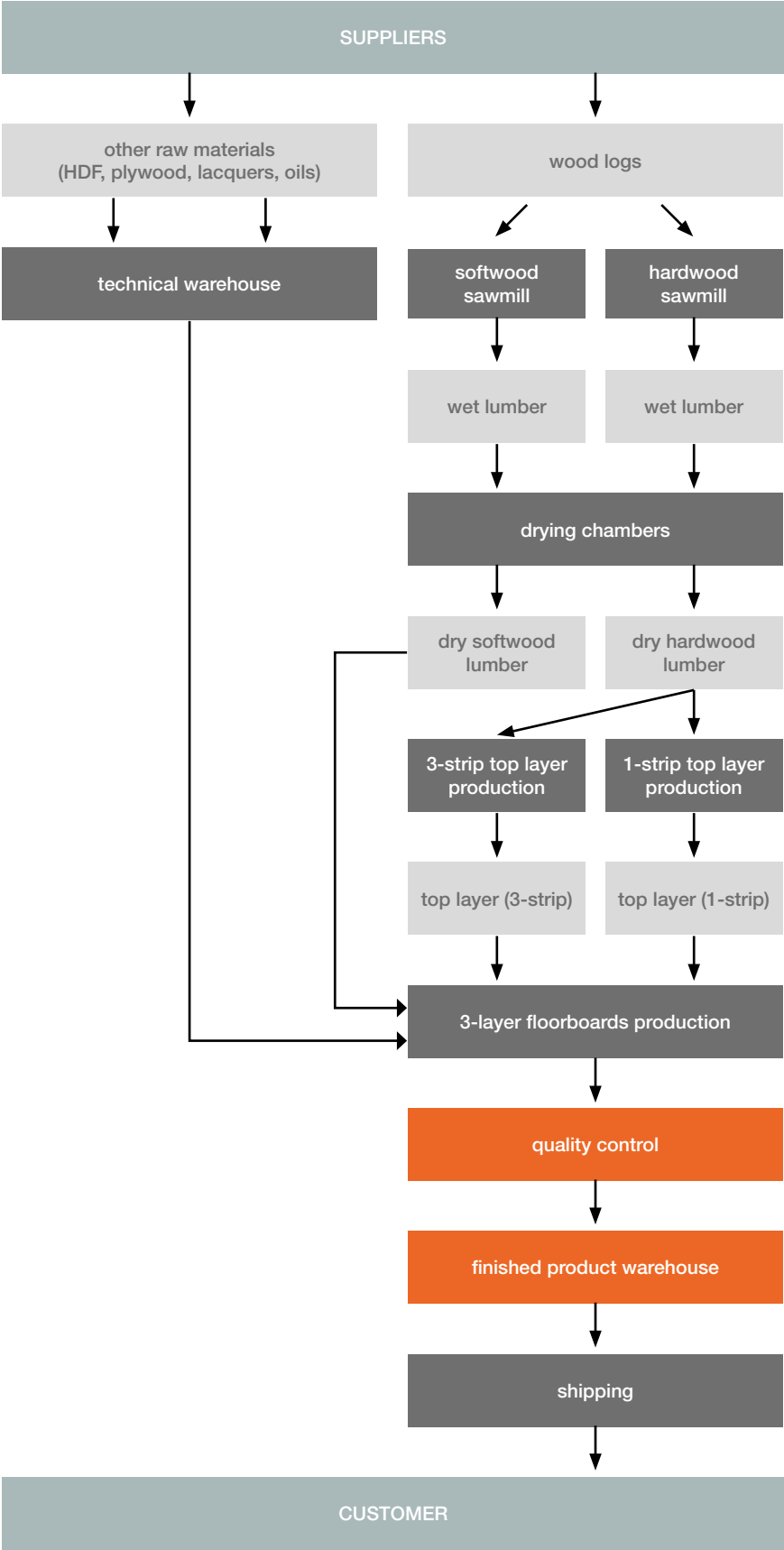
Fig. 4. A scheme of the 3-layer wooden floorboard production by Barlinek factory (Poland) v

The Barlinek Group is a manufacturer of an engineered flooring. As well as the Barlinek flooring, the Barlinek group also produces certified flooring for sporting facilities, skirting boards and wood biofuels.