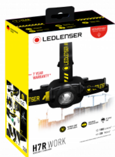
Exemplary Packaging Illustration