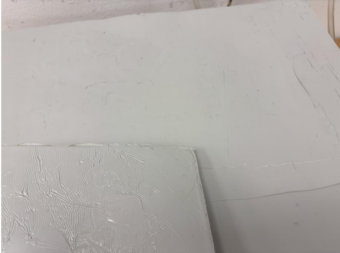
Combi Tack 547