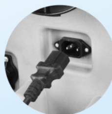
Quick power cord connection