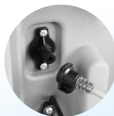
Quick draining connection

Whether it is flash flood, heavy rain or water main break, we have equipments to handle the most severe environments and assist with restoration.