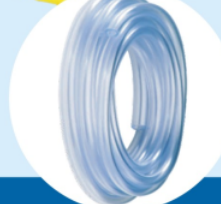
Wrinkle free tube

HIGH CAPACITY • COMPACT • LOW TEMPERATURE DEHUMIDIFIERS FOR PROFESSIONAL WATER DAMAGE AND CARPET SPECIALISTS