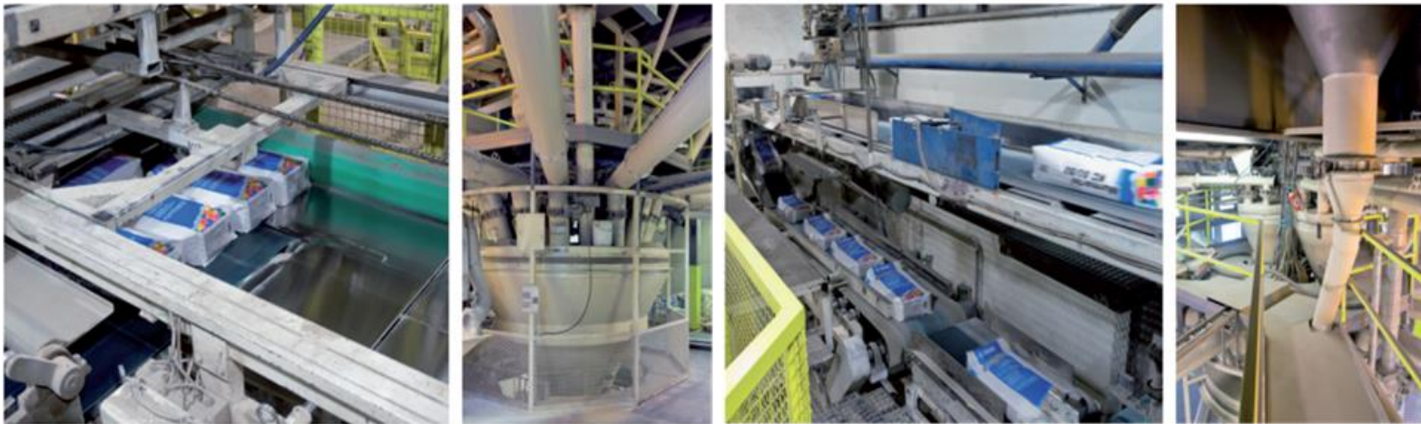
Figure 1: production process detail

The production process starts from raw materials, that are purchased from external and intercompany suppliers and stored in the plant. Bulk raw materials are stored in specific silos and added automatically in the production mixer, according to the formula of the product. Other raw materials, supplied in bags, big bags or tanks, are stored in the warehouse and added automatically or manually in the mixer. The production is a discontinuous process, in which all the components are mechanically mixed in batches. The semi-finished product is then packaged, put on wooden pallets and stored in the finished products warehouse. The quality of final products is controlled before the sale.