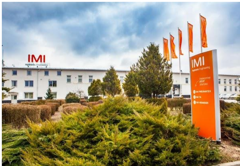
Figure 1 The view of IMI International Sp. z o.o. manufacturing plant located in Olkusz

As IMI Hydronic Engineering is a leading HVAC company with a valves montage plant located in Olkusz (Poland). Company is provider of technologies that deliver energy efficient water-based heating and cooling systems for the residential and commercial building sectors. Throughout the history, company have been at the forefront of HVAC industry innovation. The portfolio of brands has what is needed – a complete range of unique, industry-leading products and services. IMI Hydronic Engineering is a part of IMI PLC Group, listed on the London Stock Exchange on FTSE 100 list.