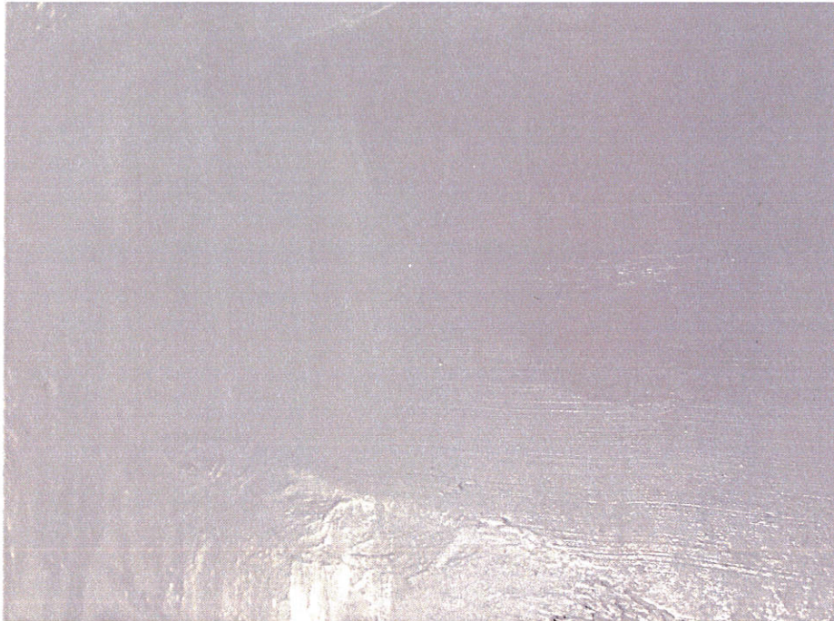
Sikaflex AT Connection