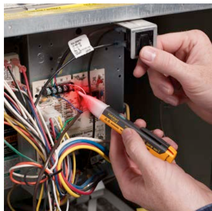
Low volt version

Fluke. Keeping your world up and running.®