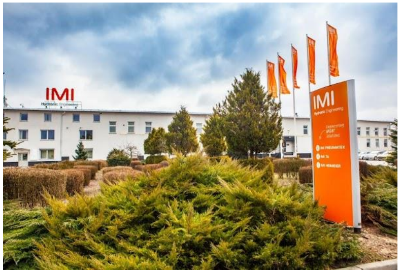
Figure 1 The view of IMI International Sp. z o.o. manufacturing plant located in Olkusz

As IMI Hydronic Engineering is a leading HVAC company with a valves montage plant located in Olkusz (Poland). Company is provider of technologies that deliver energy efficient water-based heating and cooling systems for the residential and commercial building sectors. Throughout the history, company have been at the forefront of HVAC industry innovation. The portfolio of brands has what is needed – a complete range of unique, industry-leading products and services. IMI Hydronic Engineering is a part of IMI PLC Group, listed on the London Stock Exchange on FTSE 100 list.