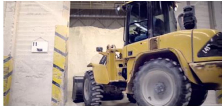
1. Unloading of raw materials

The stages of the production process are as follow: