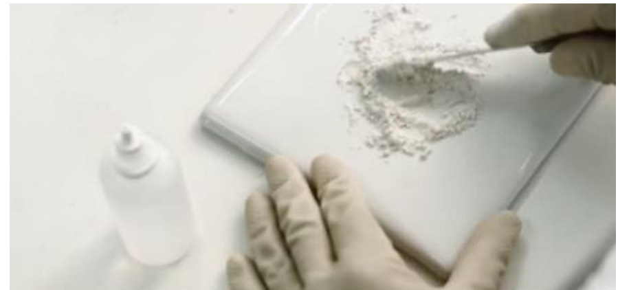
2. Preparation of the slip

Mineral raw materials (clay, kaolin, feldspar and silica) are unloaded from trucks in the areas marked for this purpose.