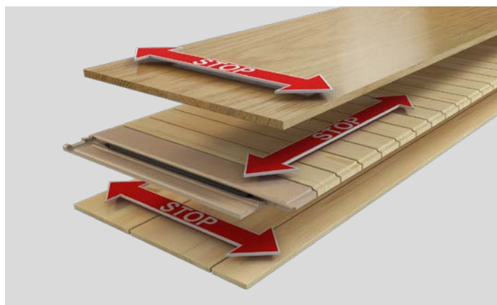
Fig. 1. Cross structure of 3-layer wooden floorboard produced by Barlinek Inwestycje Sp. z o.o.

Barlinek floorboard is made from three layers of real wood arranged in a cross structure (Fig. 1) in order to prevent swelling, squeaking or drying out causing splits. The cross construction reduces natural tension and compression of wood, provides a balance between the layers of the board, and thus guarantees the stability of the floor. The Barlinek floorboard's layered structure is suited for underfloor heating. The floorboards are joined using 5Gc joints and Barclick (Fig. 2) which allow to lay the floor without most of the tools which are usually necessary to install a floor. Specification of the product is shown in Table 1.