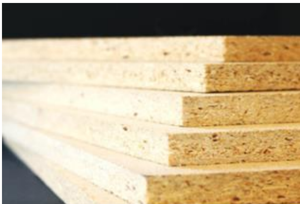
Figure 1 Picture of particle board P2

Product description: The standard particle board, P2, is used for building and furniture and can be used for walls, ceilings and flooring, but also as packaging material.