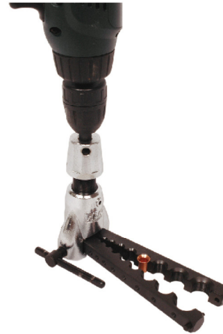
With 3/8" bit mounted in handle FTE-800 can be used with wrench or power tool