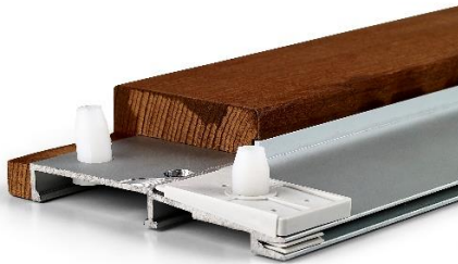
Figure 1. Finished threshold component for the frameset

Since only one of the threshold options is manufactured by JELD-WEN factory, more detailed manufacturing process of the thresholds has been left out of the graph. The manufacturing of the JELD-WEN threshold includes similar steps as the frame set manufacturing, as it undergoes the sizing, milling, surface treatment and assembling before used as a component to the frame set.