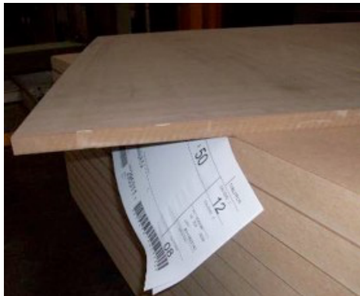
Finished product_ MDF boards