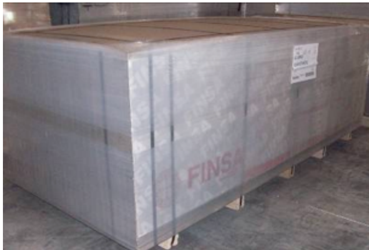
Packed product ready for shipping Melamine faced MDF boards