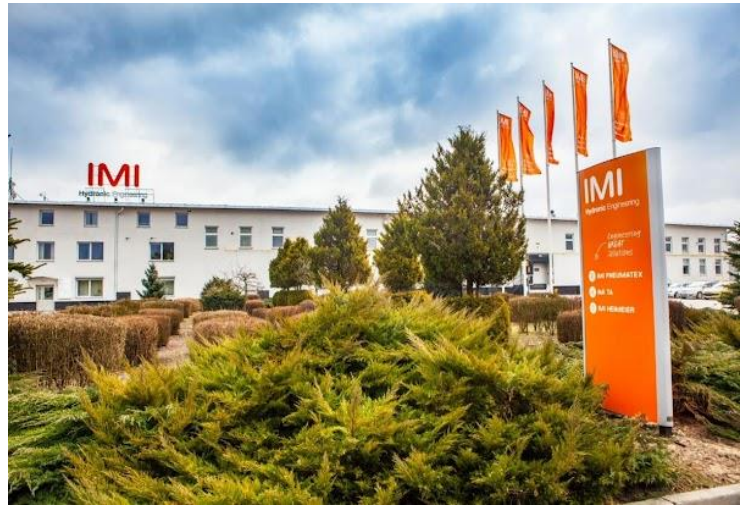
Figure 1 The view of IMI International Sp. z o.o. manufacturing plant located in Olkusz

As IMI Hydronic Engineering is a leading HVAC company with a valves montage plant located in Olkusz (Poland). Company is provider of technologies that deliver energy efficient water-based heating and cooling systems for the residential and commercial building sectors. Throughout the history, company have been at the forefront of HVAC industry innovation. The portfolio of brands has what is needed – a complete range of unique, industry-leading products and services. IMI Hydronic Engineering is a part of IMI PLC Group, listed on the London Stock Exchange on FTSE 100 list.