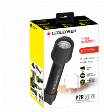
Exemplary Packaging Illustration