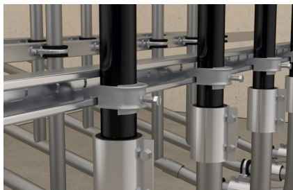
Supply lines fixed to FUS channel